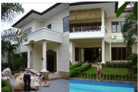
Front and back of our House in Kemang