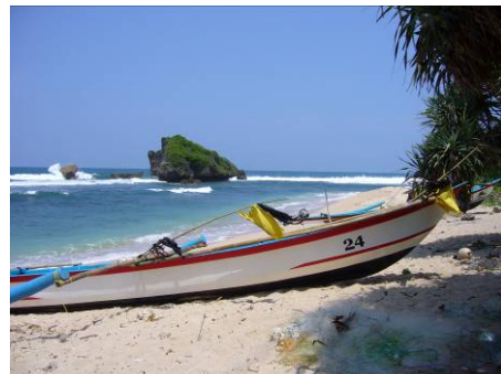
A Sunday excursion to the Indian Ocean