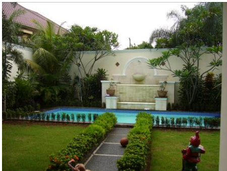
The backyard and the swimming pool

We enjoy our house – even without a dishwasher – and we are keen to have you coming sooner better than later to show you Jakarta and assist you to discover other parts of this country as we discover them ourselves.