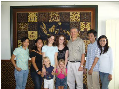
The family and some of their Bahasa Indonesia teachers in Jogjakarta in April

pore. It is a totally new experience to set something up from scratch, develop new investment opportunities for IFC in Oil Gas Mining and Chemicals in Southeast Asia.