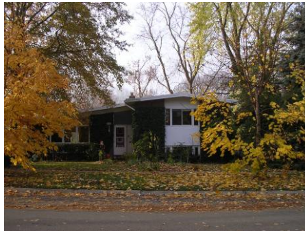
Our house in Washington in late Fall 2006